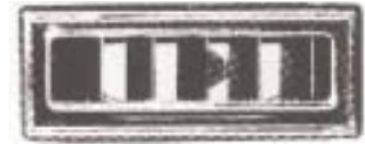
49056-VUL 3 7/8" x 1 9/16" for 2 1/2" hose.