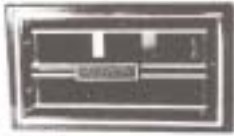
49055-VUL 3 5/8" x 2 3/8" For 2 1/2" hose. 49355-VUL (all black)