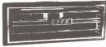
49052-VUL 5 1/8" x 2 1/2" For 2 1/2" hose. 49352-VUL (all black)