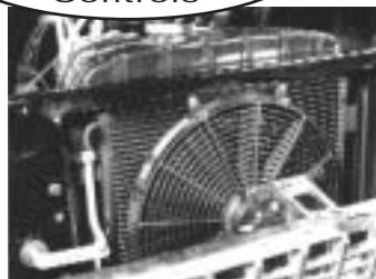
32007-VUF '55-'57 Chevy Electric SPAL fan package. For use with Super Flow condenser. Includes mounts.

NOTE: Some installations may require additional engine pulleys not included with kits. See page 56 for options. You must provide v-belts and refrigerant.