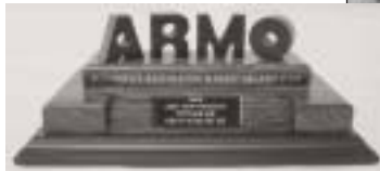
2002 ARMO Best New Product Award!

Complete kit includes: Evaporator, condenser, drier, compressor, compressor bracket, hose kit and hi/lo safety switch.